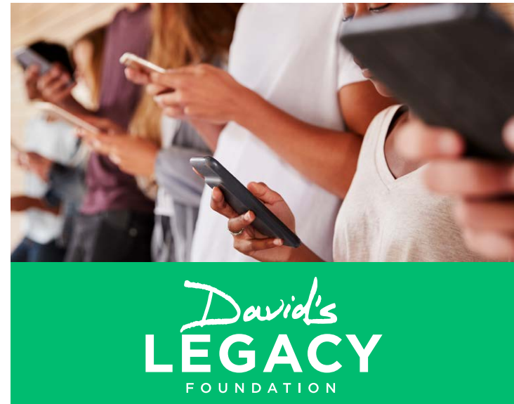
Example full color and one color logo use with brand imagery.